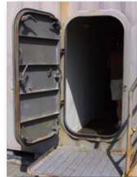
INDIVIDUALLY DOGGED DOOR